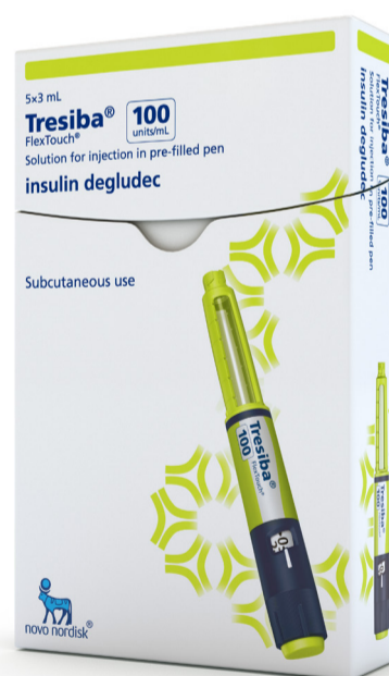
Tresiba® FlexTouch® 100 units/mL package 5 pens per carton