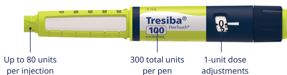
Tresiba® FlexTouch® 100 units/mL pen